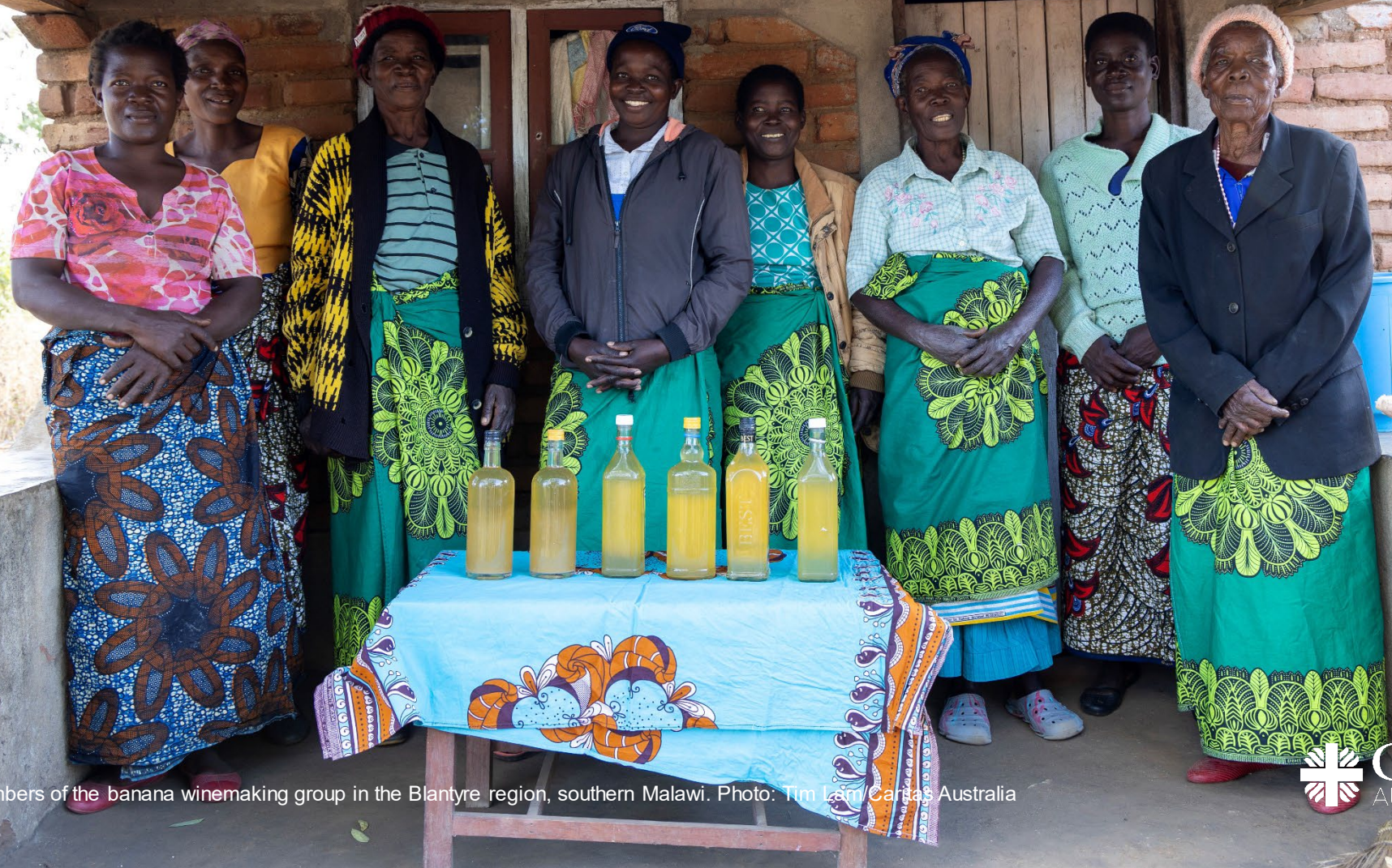
Members of the banana winemaking group in the Blantyre region, southern Malawi.