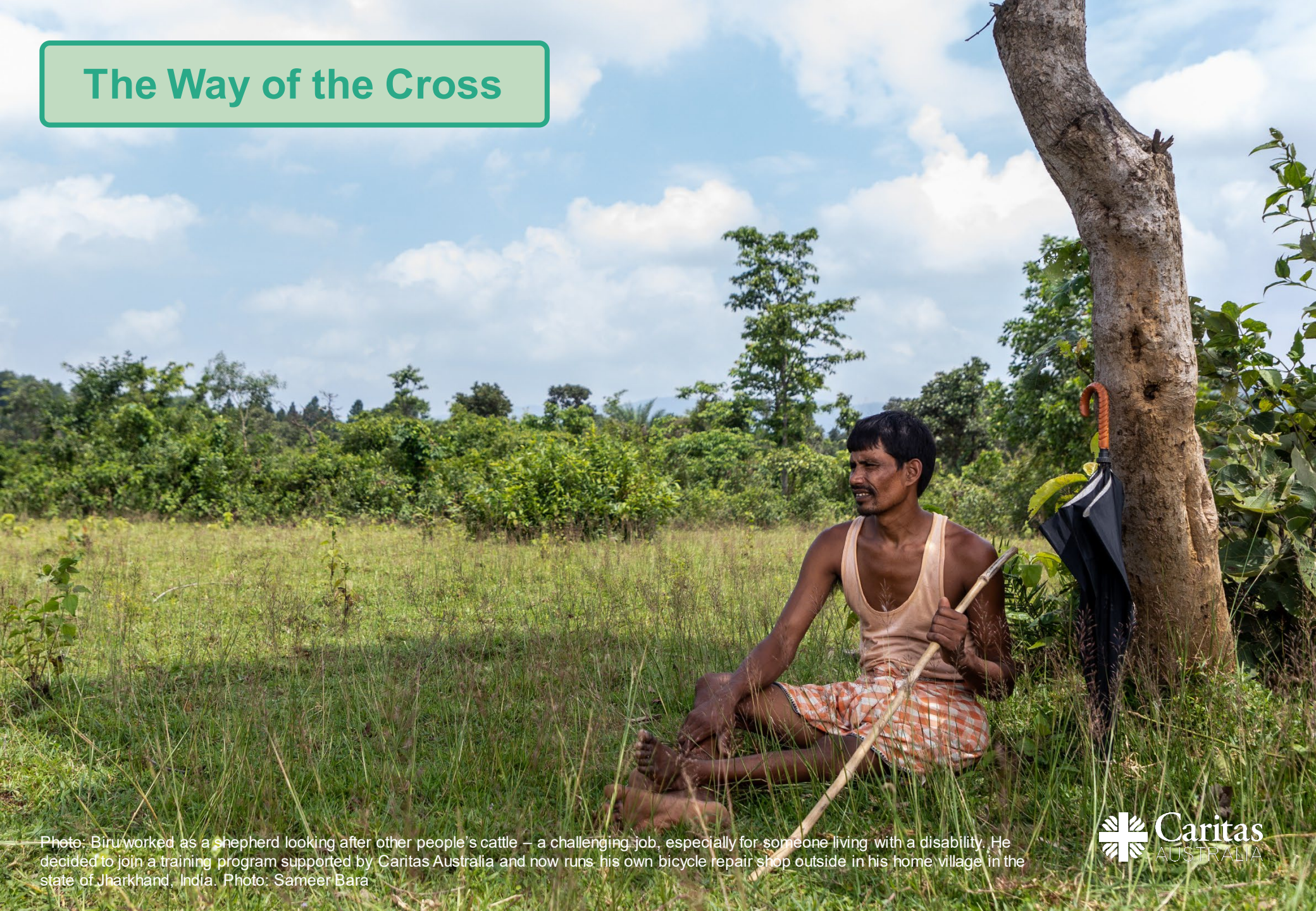
Photo: Biru worked as a shepherd looking after other people's cattle — a challenging job, especially for someone living with a disability. He decided to join a training program supported by Caritas Australia and now runs his own bicycle repair shop outside in his home village in the state of Jharkhand, India.